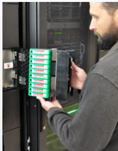
Loading ten tapes at a time