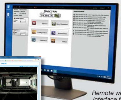
Remote web interface for computer