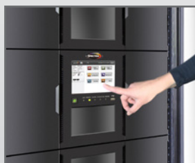
Convenient front panel color touchscreen