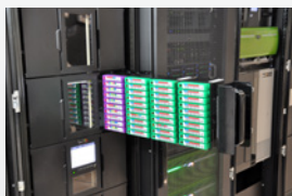
Loading 40 tapes at a time

Your data is critical to your business, but it can be expensive to store all your data. Tape is known for its affordability and Spectra Stack utilizes LTO tape media, a high-capacity tape storage technology designed for dependability and cost effectiveness. It's a powerful, scalable and adaptable tape format that addresses the exponential data growth and storage challenges organizations face today – at the most affordable cost per GB in the industry. For as low as 1 cent per gigabyte, Spectra Stack delivers an extremely reasonable data storage option.