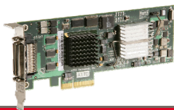
ATTO ExpressPCI UL5D LP