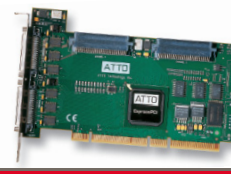
ATTO ExpressPCI UL4D